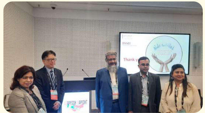
Team Bangladesh @ APFSSH, Melbourne, 2020