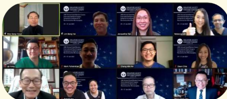
Faculty and Participants @ SSHS Virtual Meeting January 2021

SSHS organized a Resident Review Series for Hand, Orthopaedics and Plastic Surgery residents over a virtual platform on a weekly basis from 30 May to 18 July 2020 (8 sessions). The society also conducted 3 online teaching sessions for Hand Surgery trainees in 2020/2021.