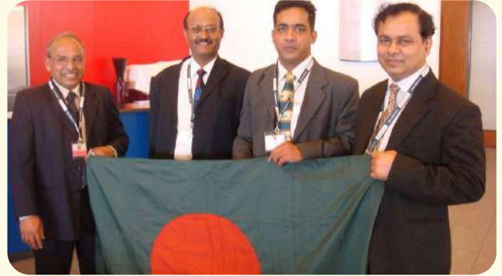
Bangladesh becoming 50th Member of IFSSH, Lucerne, 2008