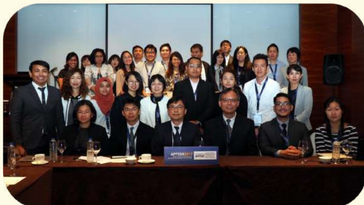
APFSHT Executive Committee Group Photo @ Cebu 2017