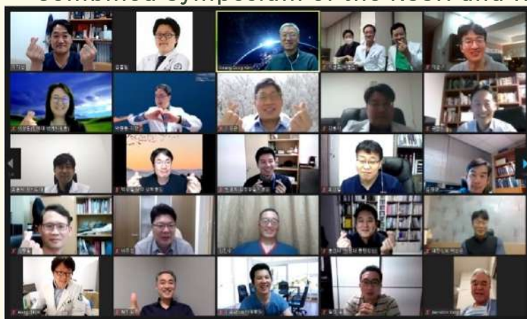
1st KSSH Webinar Symposium 2021

The number of attendees were more than we expected, reflecting the desire to continue learning and sharing knowledge in hand surgery. We found this platform was welcomed by our younger members who appreciated the time and energy saved compared to in-person meetings. We are planning to continue this bimonthly webinar.