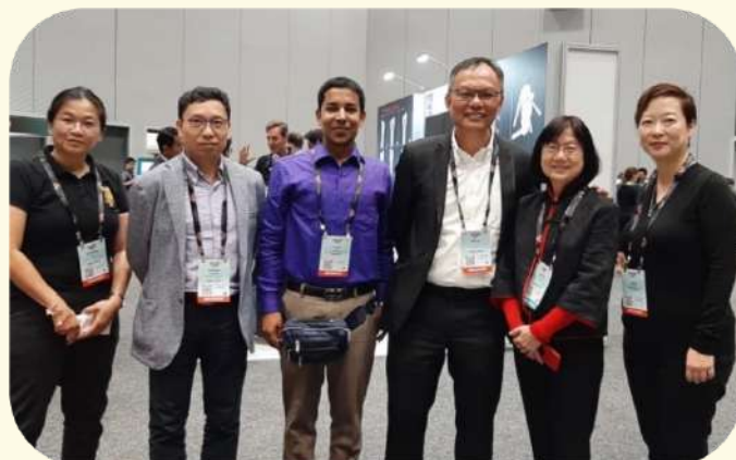
Hand Therapist Delegates from Hong Kong, Singapore, Malaysia and Bangladesh @ Melbourne 2020