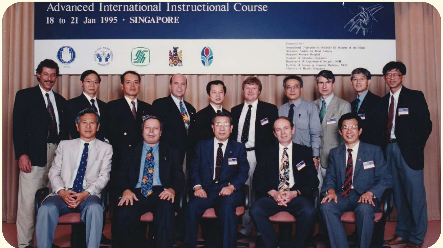
International Faculty with SGH Team @ Advanced Instructional Course, January 1995