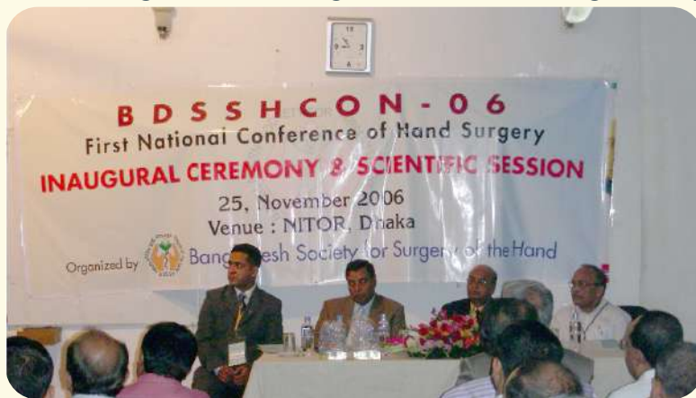
BDSSHCON-06, NITOR, 25 Nov 2006