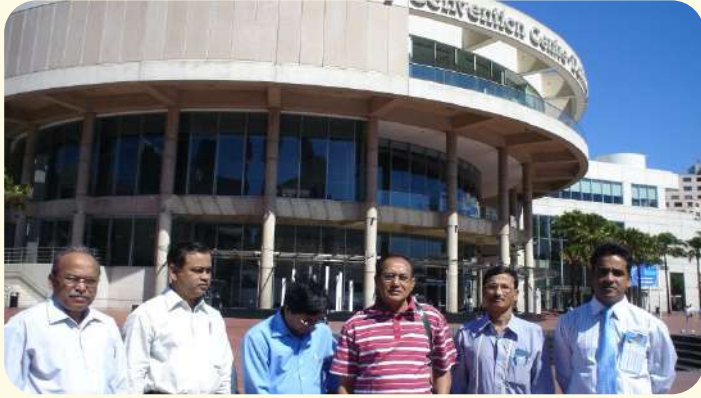
Team Bangladesh @ IFSSH, Sydney, 2007