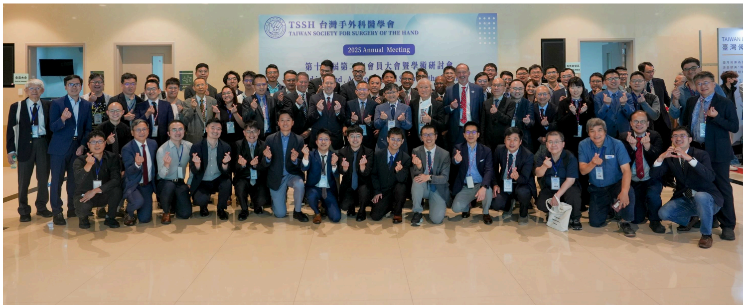
2025 TSSH Annual Meeting 3 rd – 4 th May, 2025, Linkou CGMH, Taiwan

In 2025, the Taiwan Society for Surgery of the Hand (TSSH) reached new heights in advancing hand surgery and fostering global collaboration, marking a year of innovation and achievement. Held on May 3–4, the Annual Meeting embraced the theme “Hand in Hand: Advancing and Shaping the Future” showcasing the spirit of innovation and partnership within the hand surgery community.