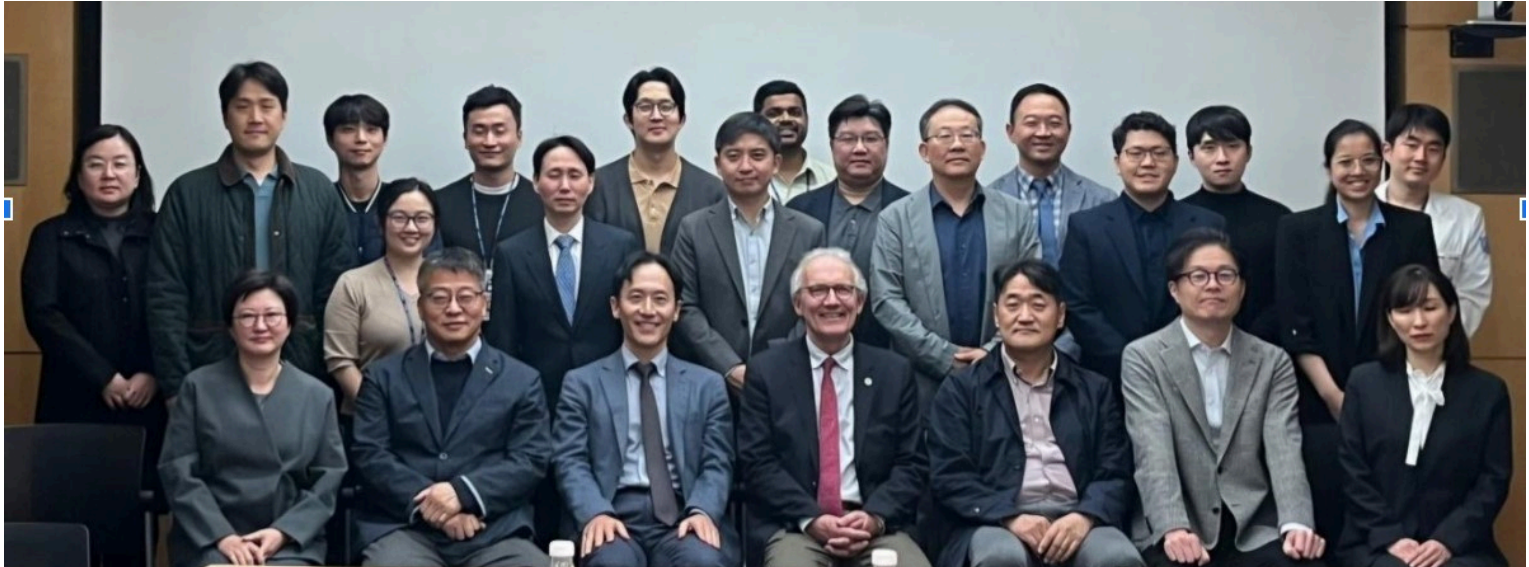
VISIT TO KOREAN HAND SURGERY SOCIETY ANNUAL SCIENTIFIC MEETING 2ND NOVEMBER 2024