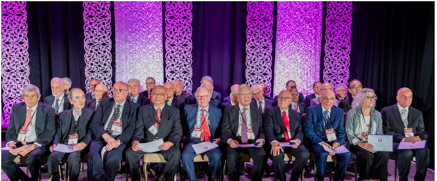
Pioneers of Hand Surgery 2025

recently awarded the special honour of being named an IFSSH Pioneer of Hand Surgery at the recent IFSSH meeting in Washington.