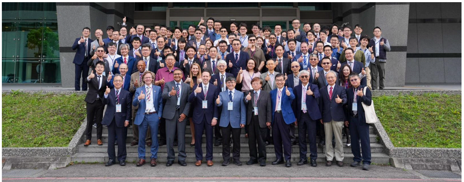
2025 TSSH Annual Meeting 3 rd – 4 th May, 2025, Linkou CGMH, Taiwan