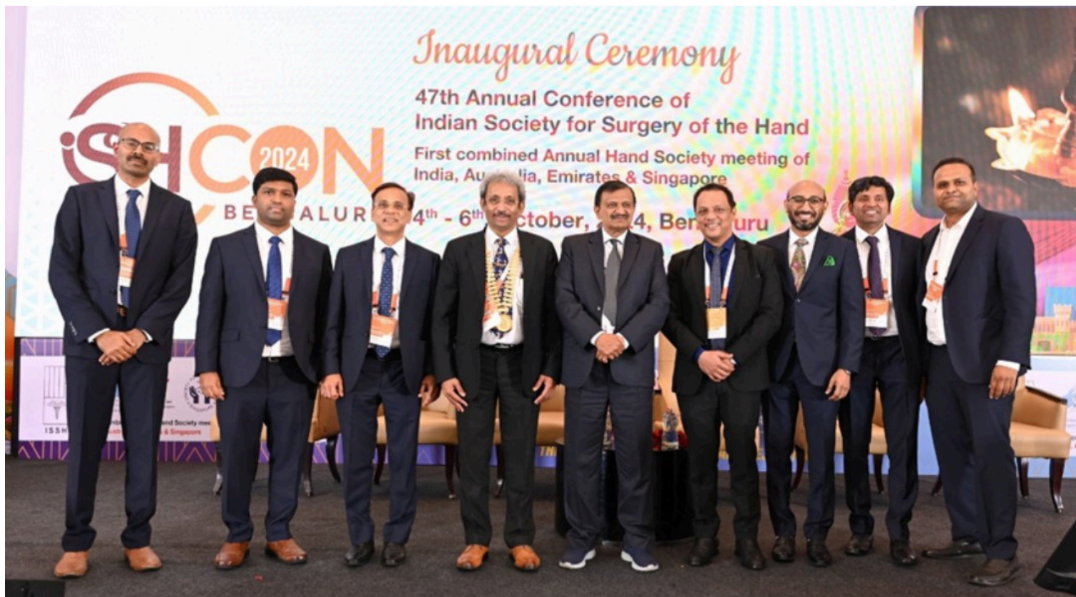
47TH ANNUAL CONFERENCE OF THE INDIAN SOCIETY FOR SURGERY OF THE HAND: ISSHCON 2024